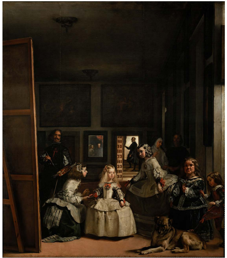
Diego Velazquez' Las Meninas